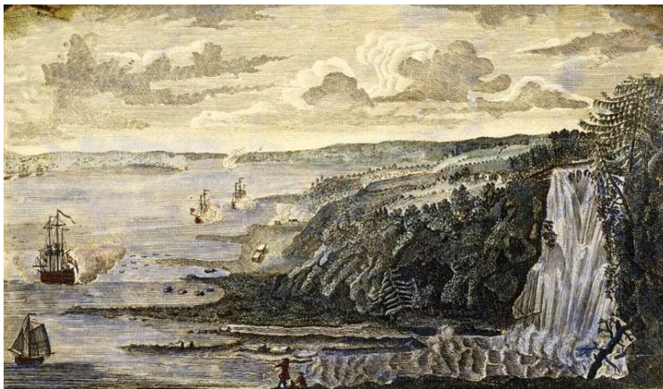
Une gravure à l'eau-forte des alentours 1770 représente la bataille de Montmorency du 31 juillet 1759 près de Québec (en regard).

Today, we take a particular note of an article written in French by historian Serge Durflinger entitled "Repoussés à Beauport" in the July/August 2024 issue, on pages 10 and 11.