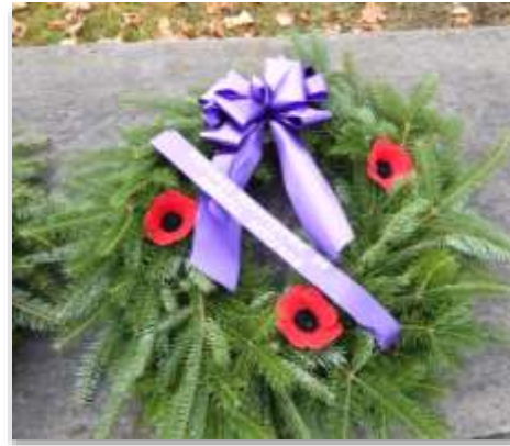
Wreath laid at the Cenotaph in New Richmond on November 11, 2020

On November 2 nd , our branch sent its members a release expressing its gratitude to the veterans across the country who deserve to be recognized for putting the safety and freedom of all Canadians before their own.