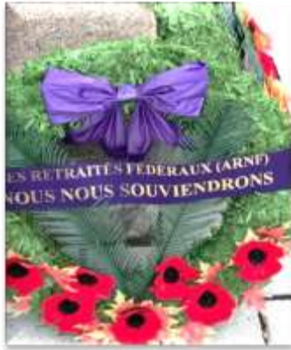
Wreath deposited at the Bagotville military base on November 11, 2020