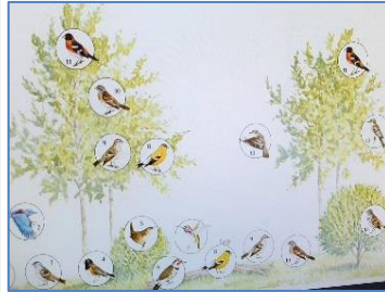
Bird habitat diagram