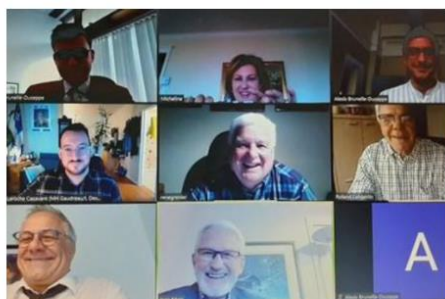
Rencontre Zoom de la Section de Québec avec les députés Luc Désilets et Alexis Brunelle-Duceppe.

Our meeting with MP Luc Désilets, Member of Parliament for Rivière-des-Mille-Isles and member of the Standing Committee on Veterans Affairs brought our invitation to appear on the persistent backlog of disability benefits claims at Veterans Affairs Canada.