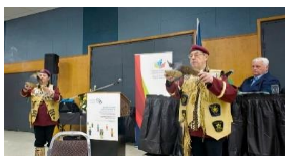
Purification of the Assembly