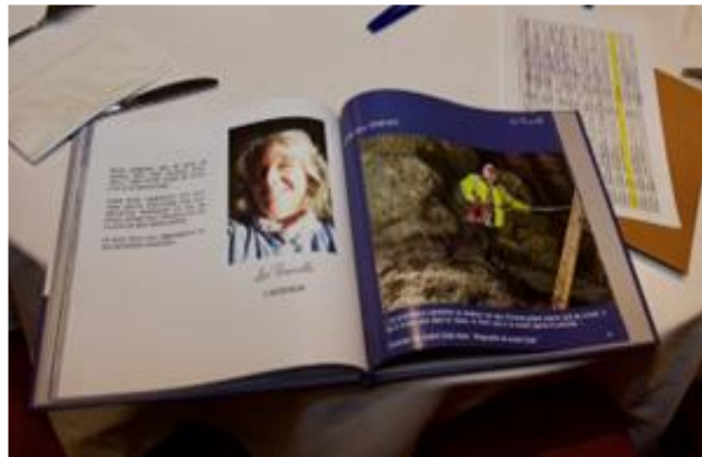
Album Souvenir – Un cliché vaut mille mots