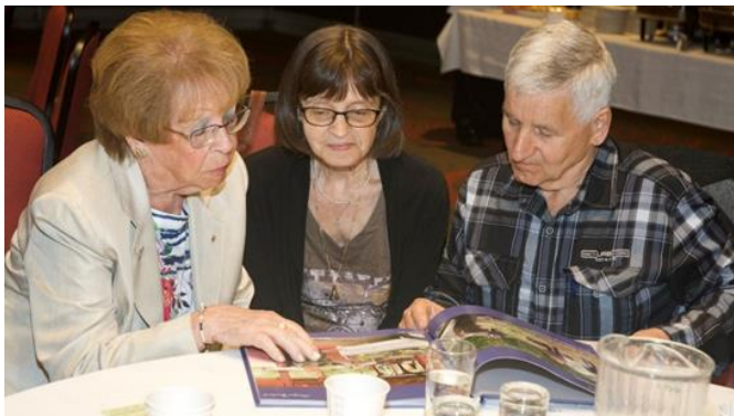
Participants very interested in the quality of the images in the album.