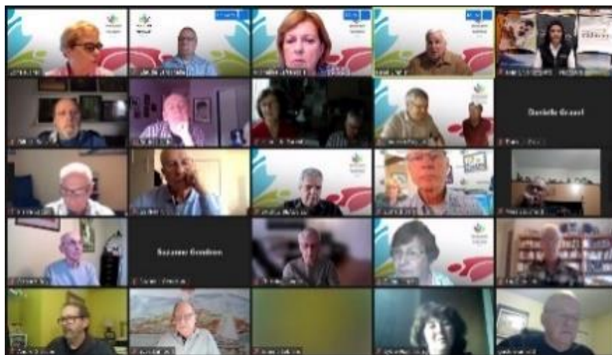
Participants in the virtual GIM of October 22, 2021