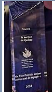
Excellence Award for Sections 2024

Each year, FSNA's 77 branches are invited to submit their nominations to the National Selection Committee. This important national award was given to us for our efforts in member recruitment and mobilization, volunteer involvement and advocacy. Many thanks to our valiant volunteers and to all our members for their support of the Quebec Branch!