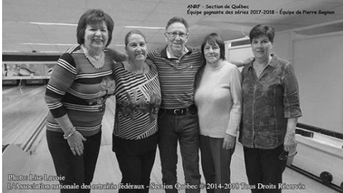
2017-18 Winning Team