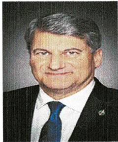
Gérard Deltell Conservative Louis St-Laurent Riding

Each Branch is invited to contact members of Parliament in its territory, regardless of political stripe, to share our priorities with them and secure their commitment to seize every opportunity to protect federal pensions and hard-earned benefits of federal retirees. We call on them to support meaningful policies that improve the lives of retirees and future retirees and their families.